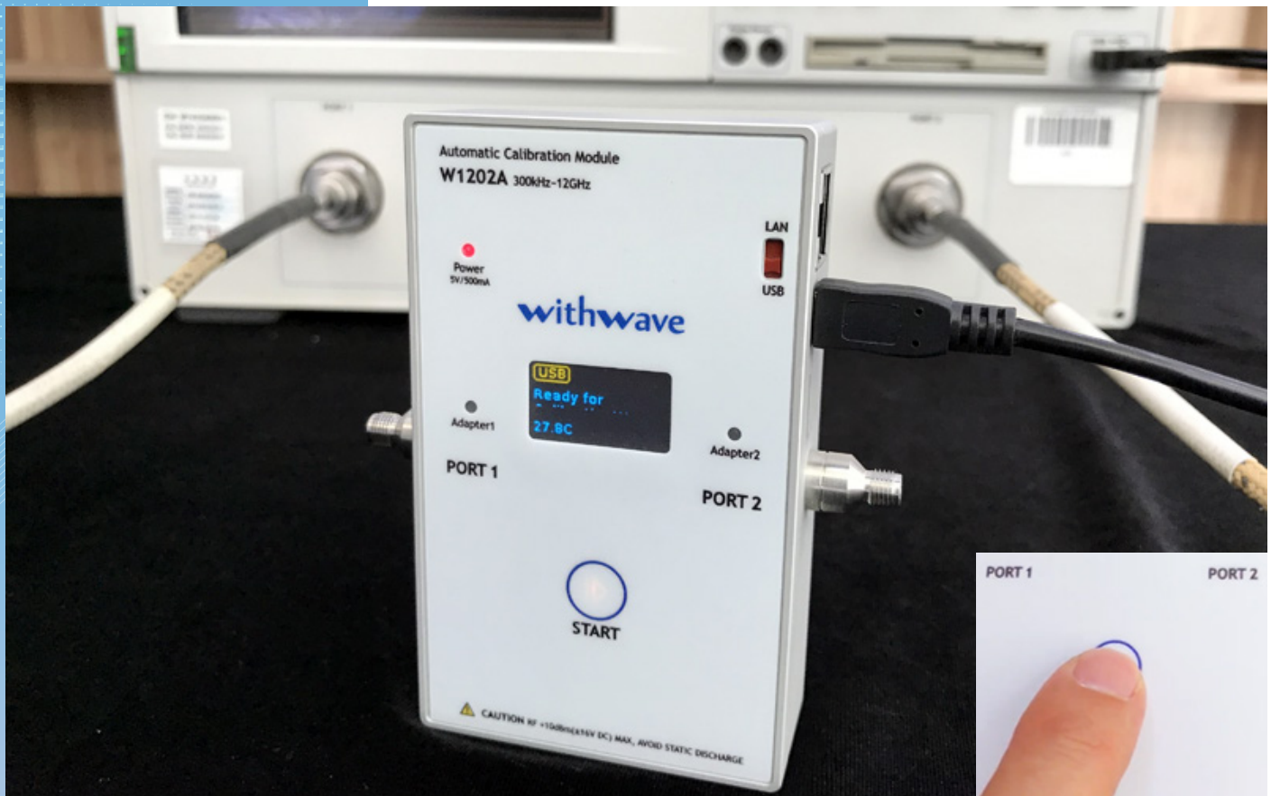
One-Push START button

These modules are powered up via USB or \Phi 5.5 DC connector and communicate with VNA via USB or LAN and designed for full one-port through two-port calibrations of VNAs by One-Push START button . These modules work as host systems, measures and calculates calibration coefficients and sends it to VNA easily.